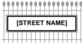
PLATE AFFIXED TO RAILINGS. Plate is to have a frame surround. The plate is to be manufactured with 2no channels horizontally along its rear to enable fixing to the railing by plate or clips.

PLATE AFFIXED TO WALL. No frame for the plate is required and is to be fixed directly into the wall.