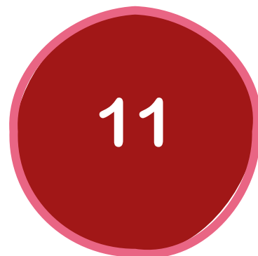
Recommendations to Cabinet/Council