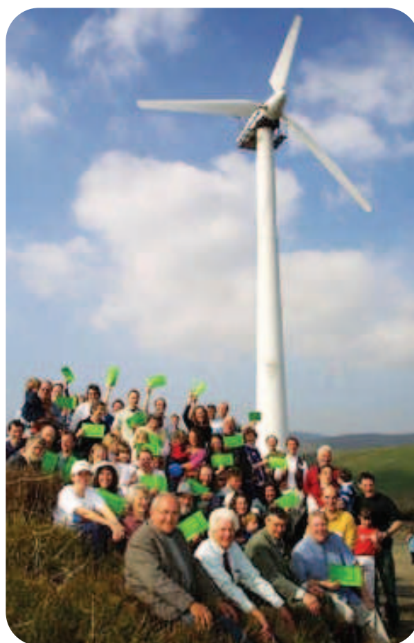
Bro Dyfi Community Wind Turbine - www.bdcrc.org.uk