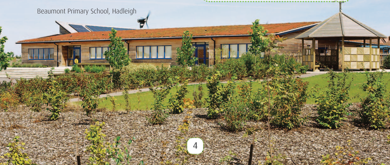
Beaumont Primary School, Hadleigh