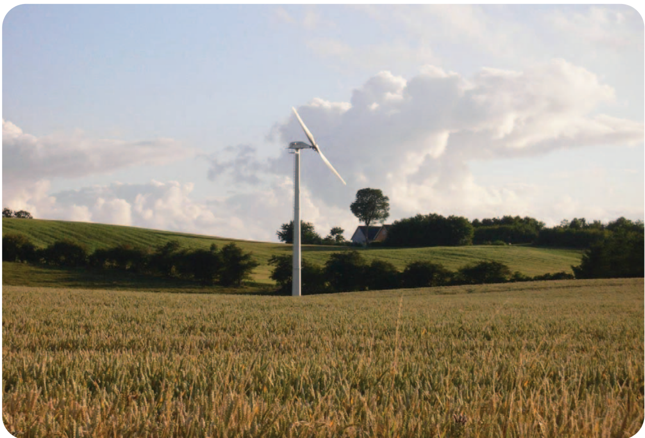
A Gaia 11kW wind turbine has a hub height of 18m.

more rigorous planning stage so it's always best to speak to your local planning department early on (see pg 17) and be open and honest about your plans with your neighbours and wider community.