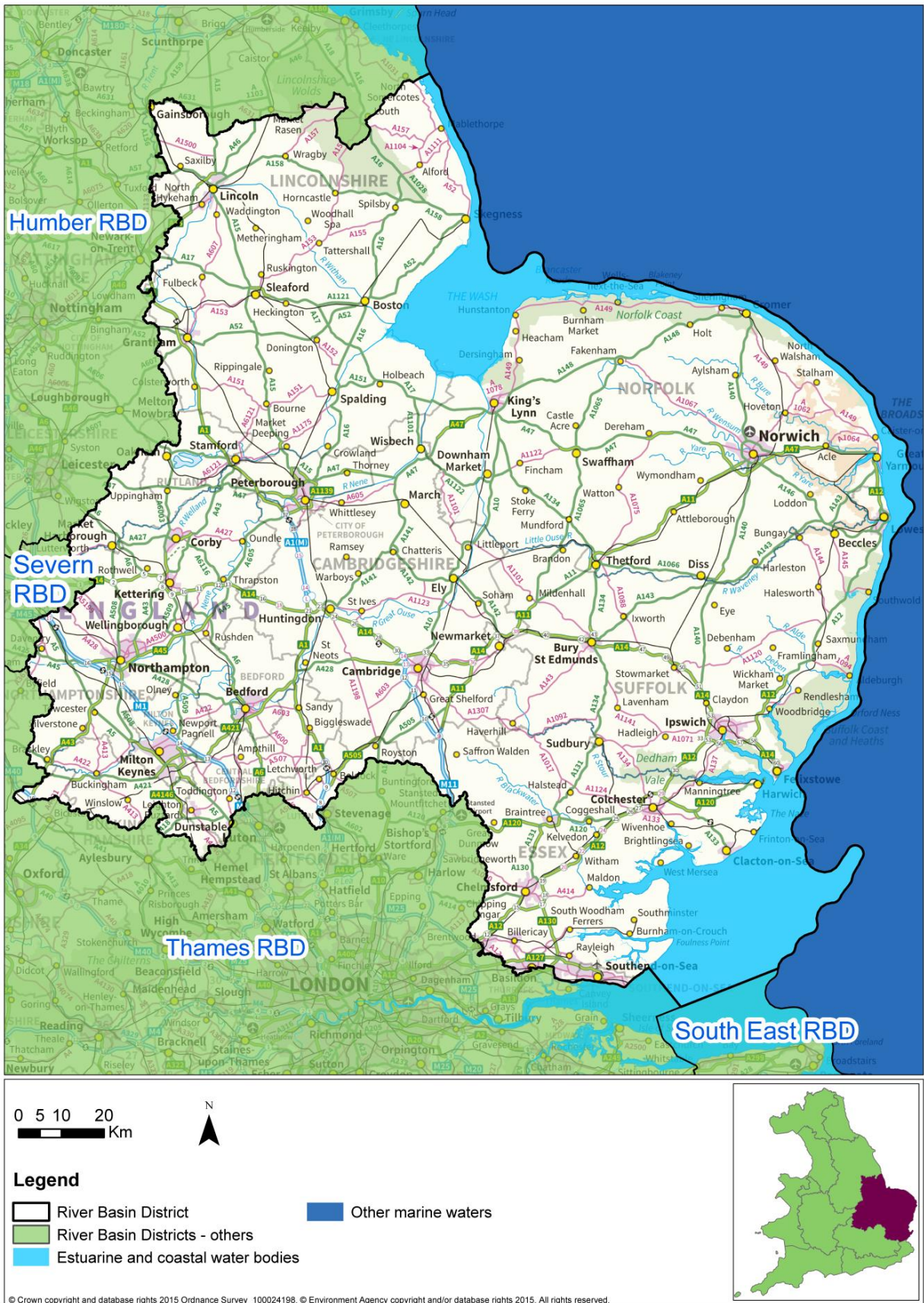
Figure 1: Map of the Anglian river basin district